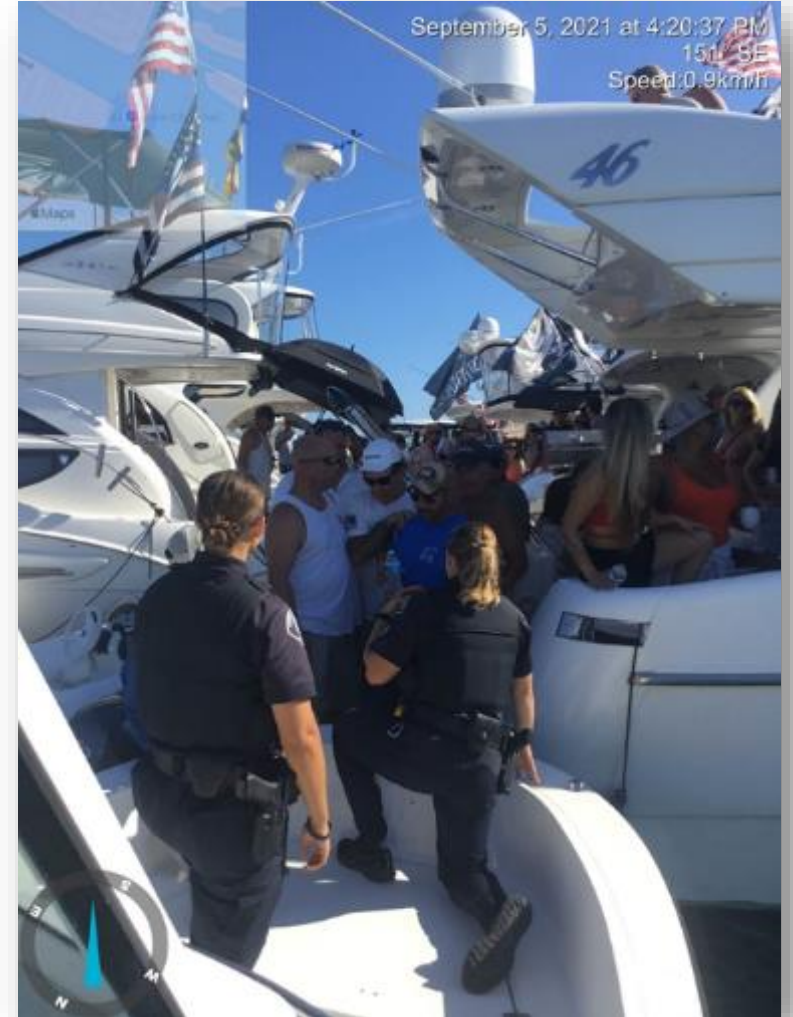
Uniformed NBPD Officers aboard a Harbor Department Vessel