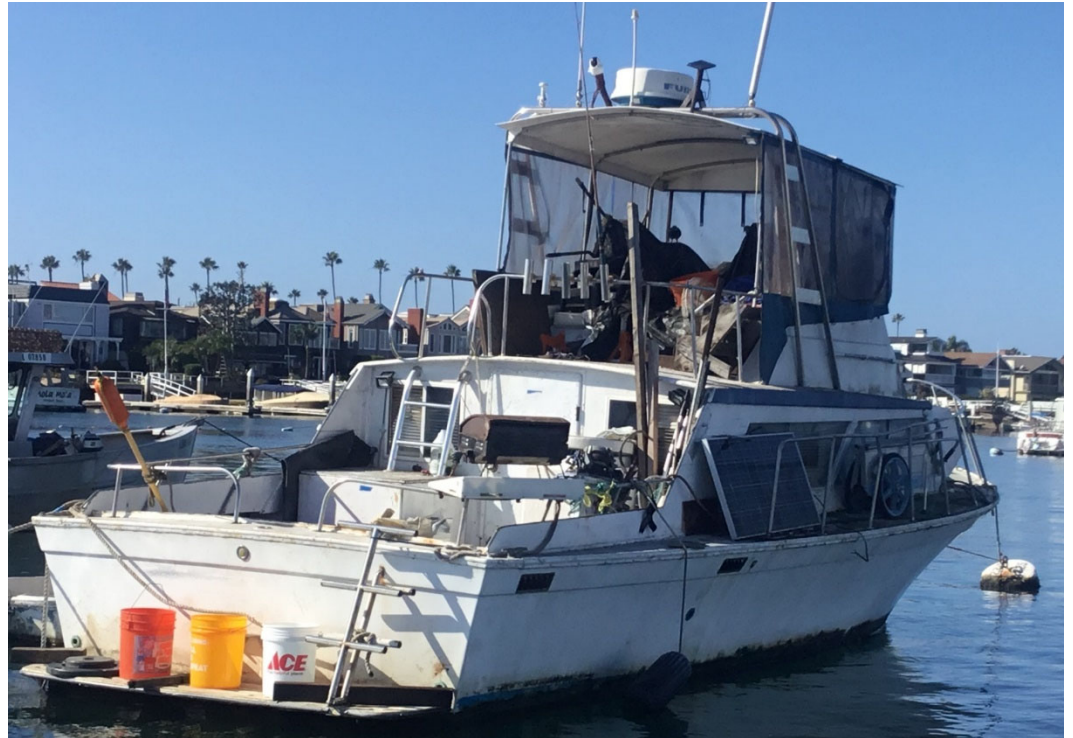
A vessel that was recently destroyed using VTIP grant money