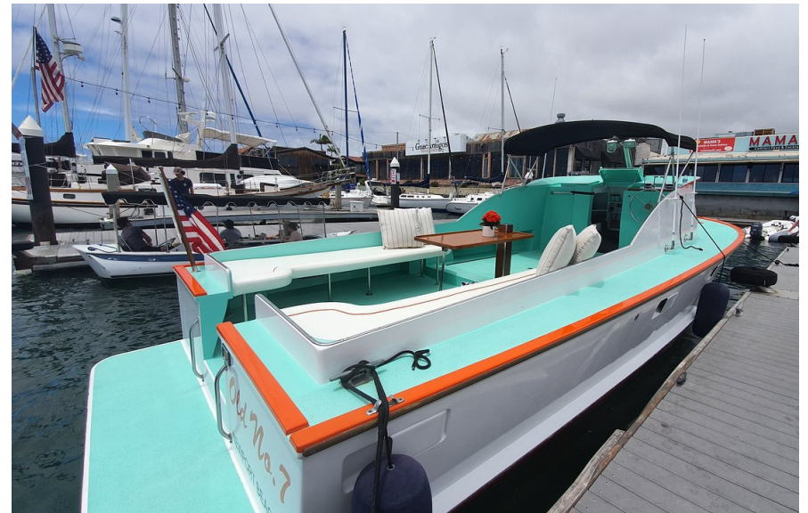
One of the Harbor's newer MAP Permittees: Baywatch Boat Charters