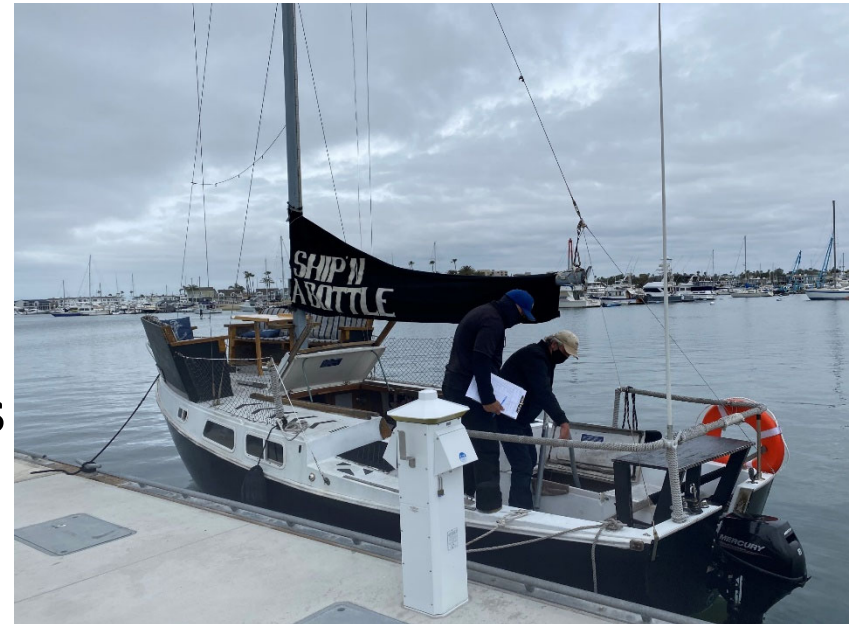
Code Enforcement staff inspecting SHOR registrant Ship N' A Bottle