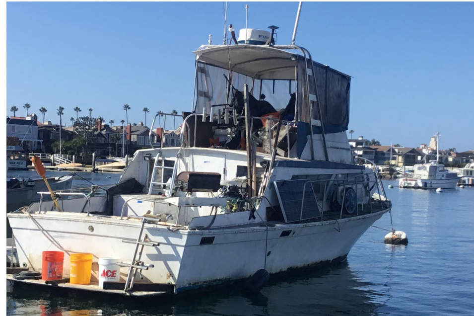
Vessel removed from the "A" Mooring Field.