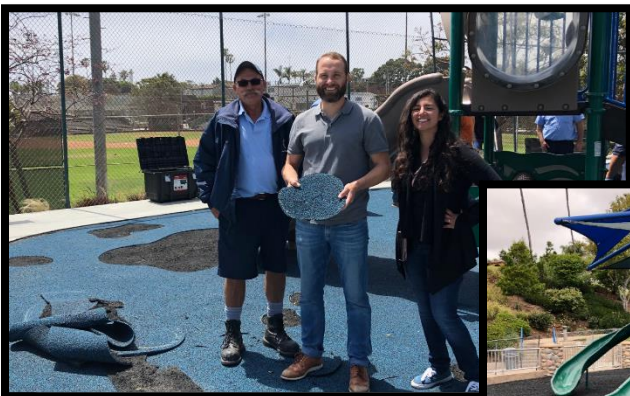
Pictured: Surfacing improvements at Cliff Drive Park