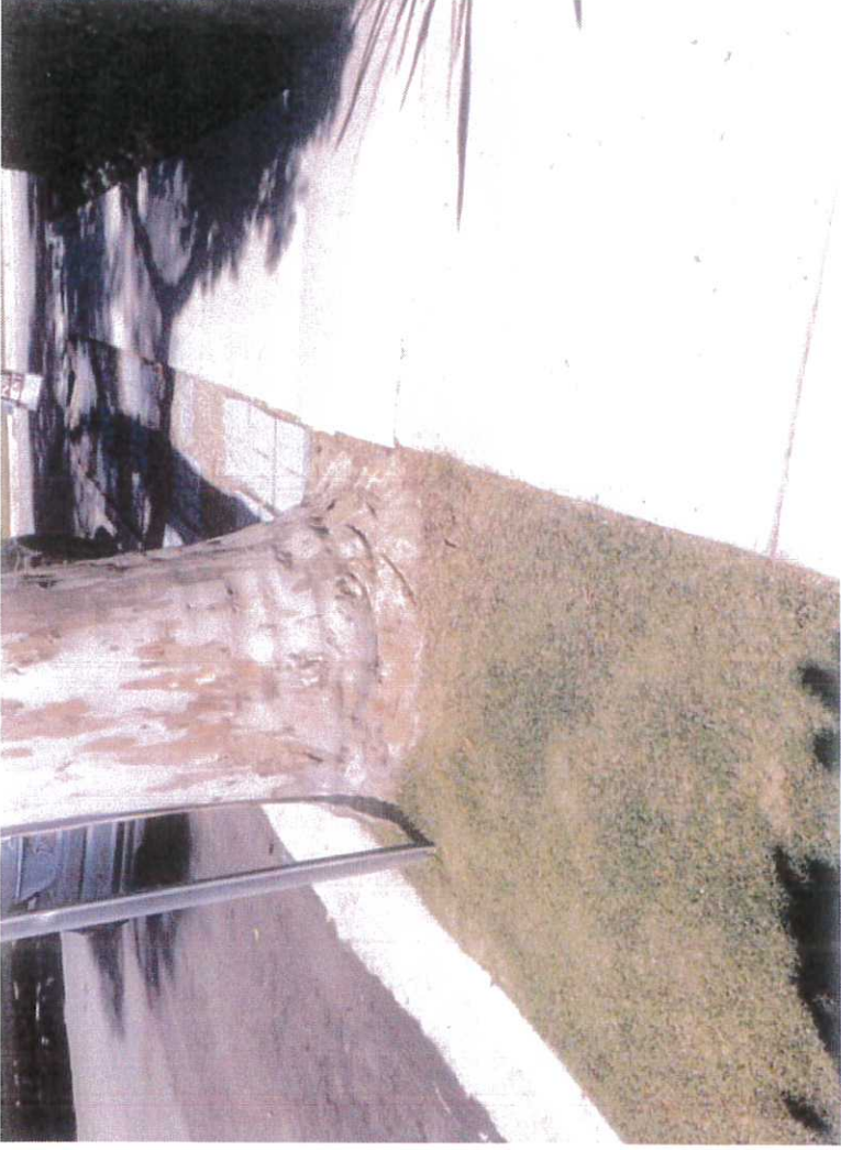
720 Jasmine Avenue