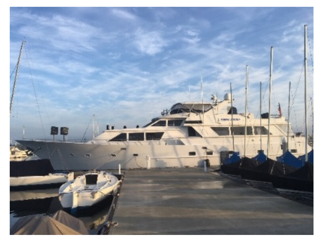
2018 Parade Lead Vessel – Burning Daylight