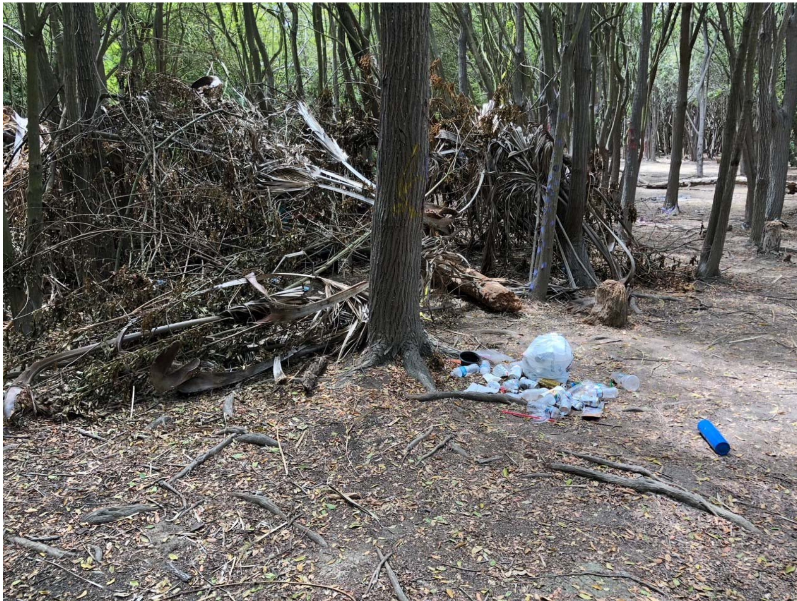
Figure 3 - Big Canyon Pepper Tree Forest