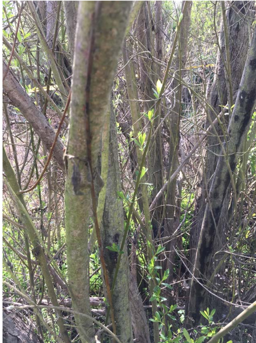
Figure 4 - Example of Arroyo Willow Attacked by PSHB in Big Canyon (Dark blotches on trunk.)