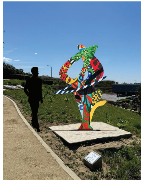
Ambrosio, Pamela. Interplay