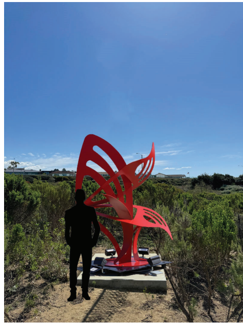
DeBruyne, Hilde. Growing Wings