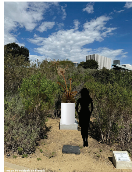
Blazejovsky, Vojtech. Heavy Landing