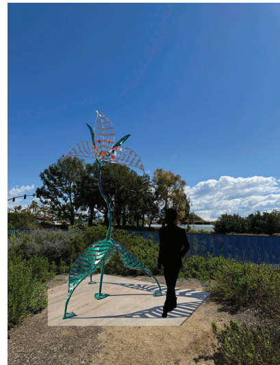
Cartwright, Matt. Trillium Bus Stop Bench