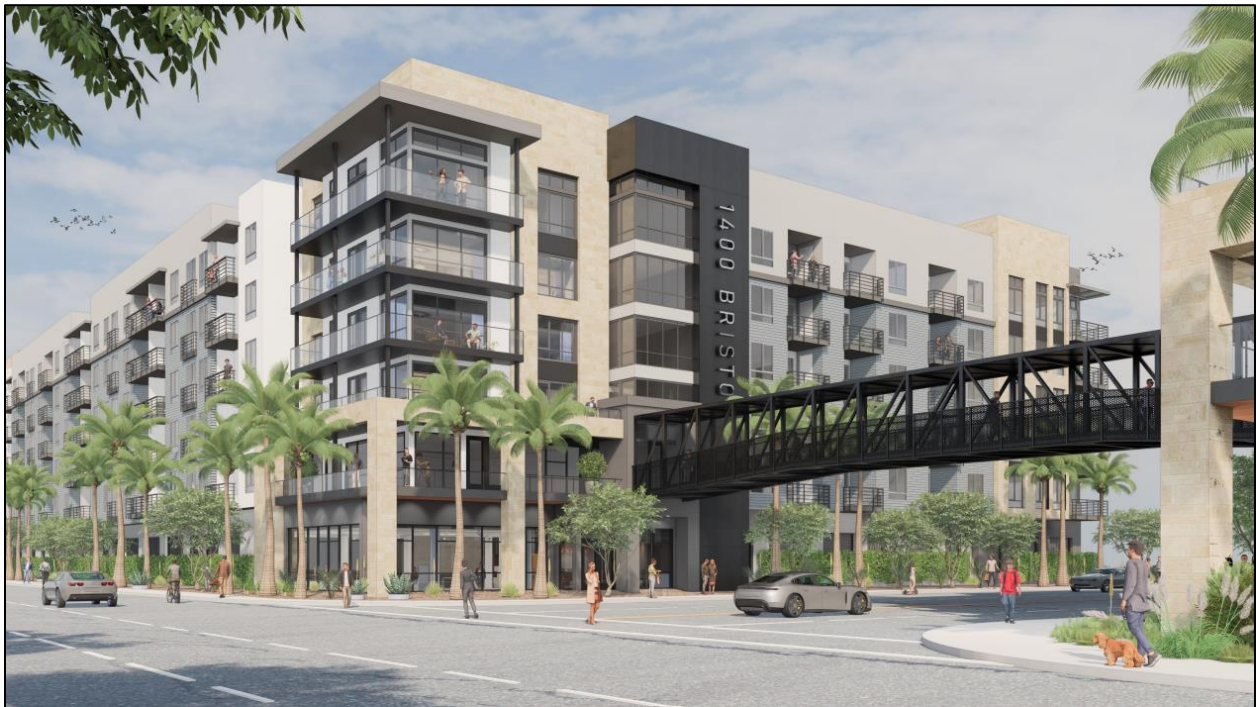
Figure 2: Rendering from the Intersection of Bristol Street and Spruce Street

The 229 apartment units include 40 studio units, 126 one-bedroom units, and 63 two-bedroom units. The studio units would be 515 square feet, the one-bedroom units would range from 613 to 896 square feet, and the two-bedroom units are proposed to range from 1,049 to 1,469 square feet.