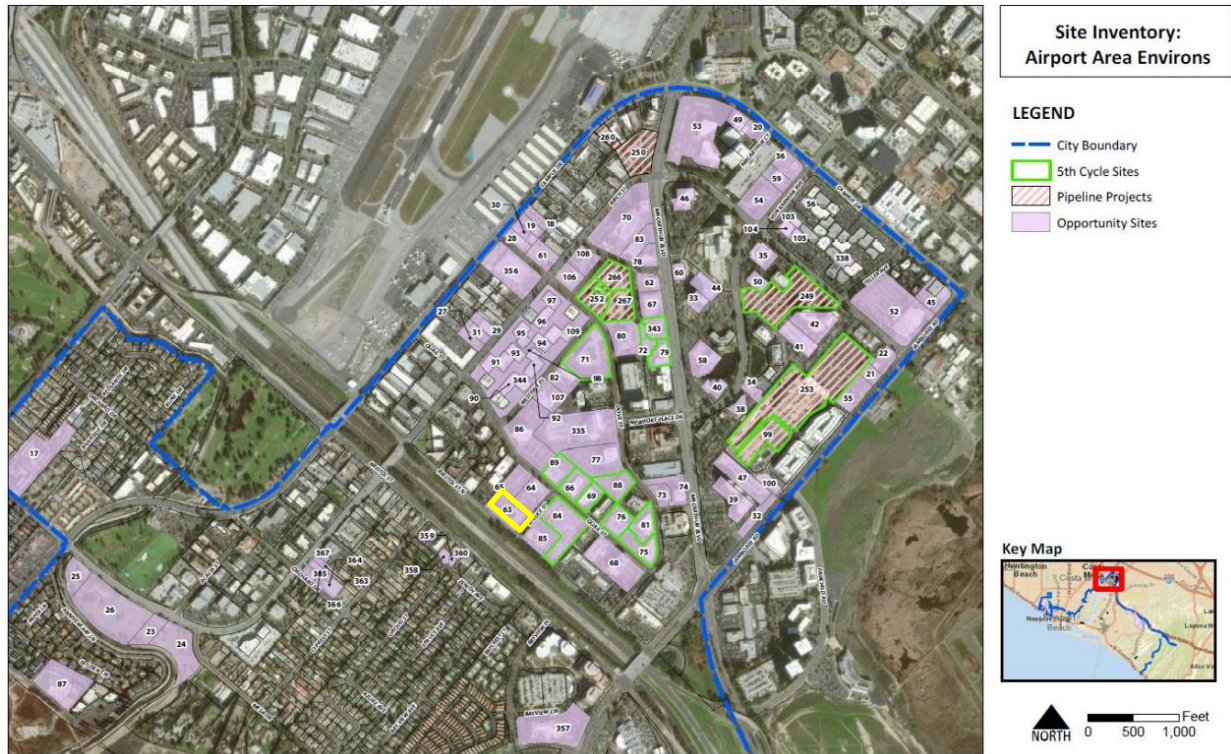
Figure B-3: Airport Area Environs – Sites Inventory