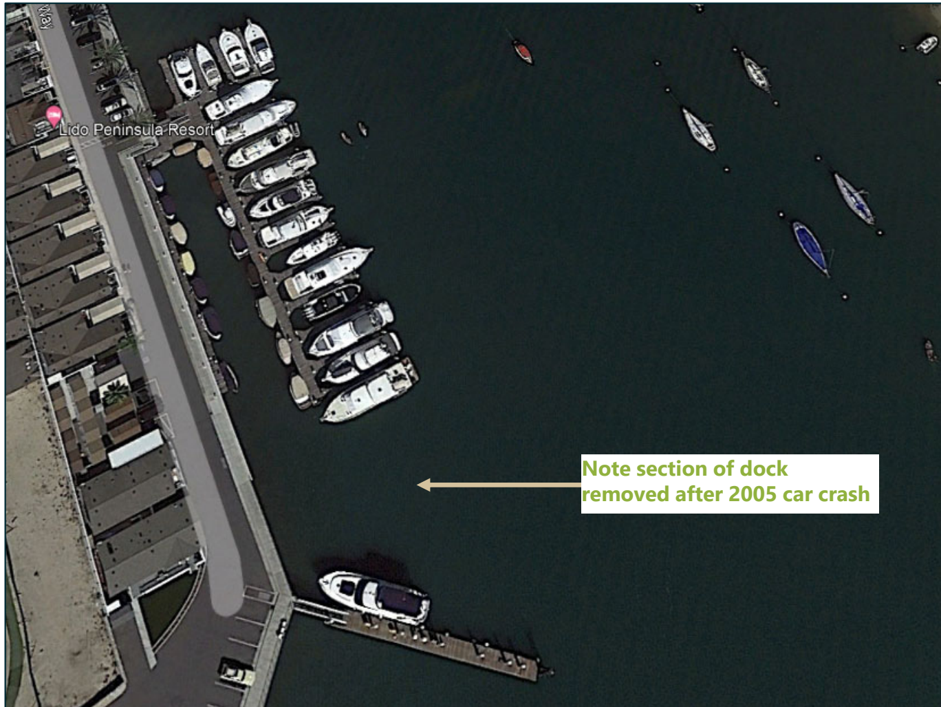
Aerial View of the Project Area—After 2005 Car Incident