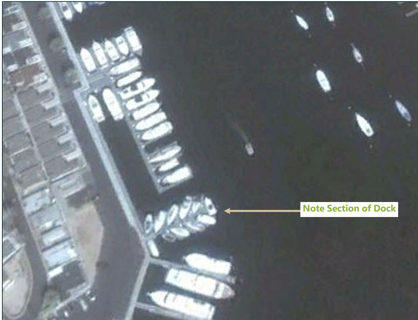
Aerial View of the Project Area—Before 2005 Car Incident