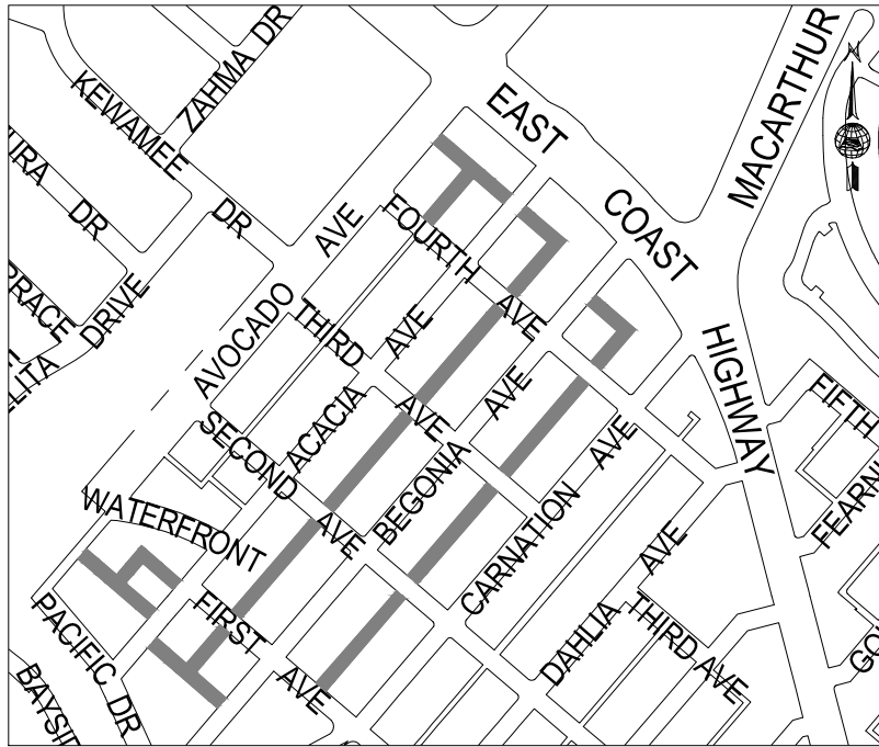
ASSESSMENT DISTRICT 117 ALLEYS