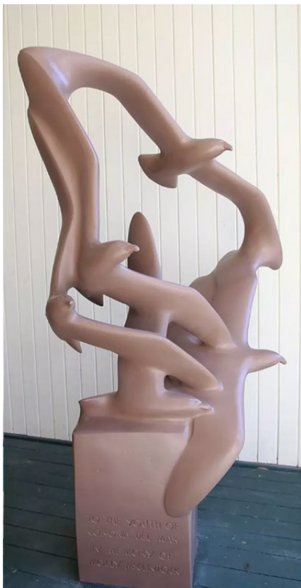
Photo of sculpture after 2015 restoration