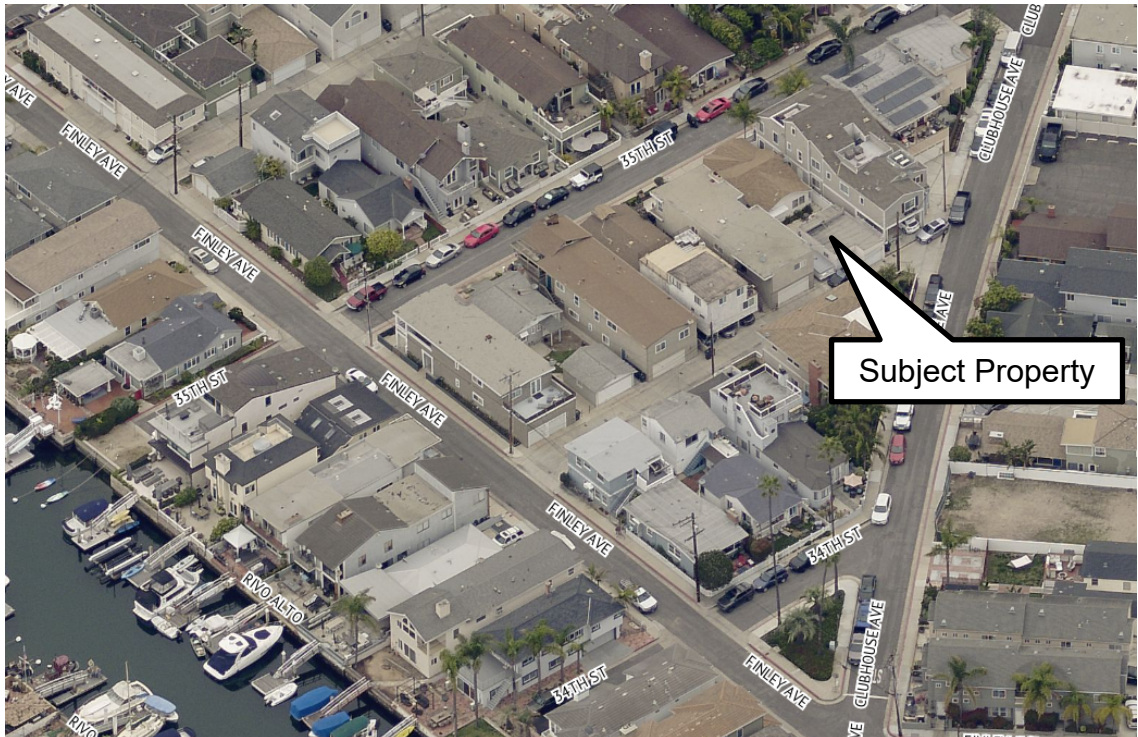
Figure 1: Oblique Aerial Image of Subject Property