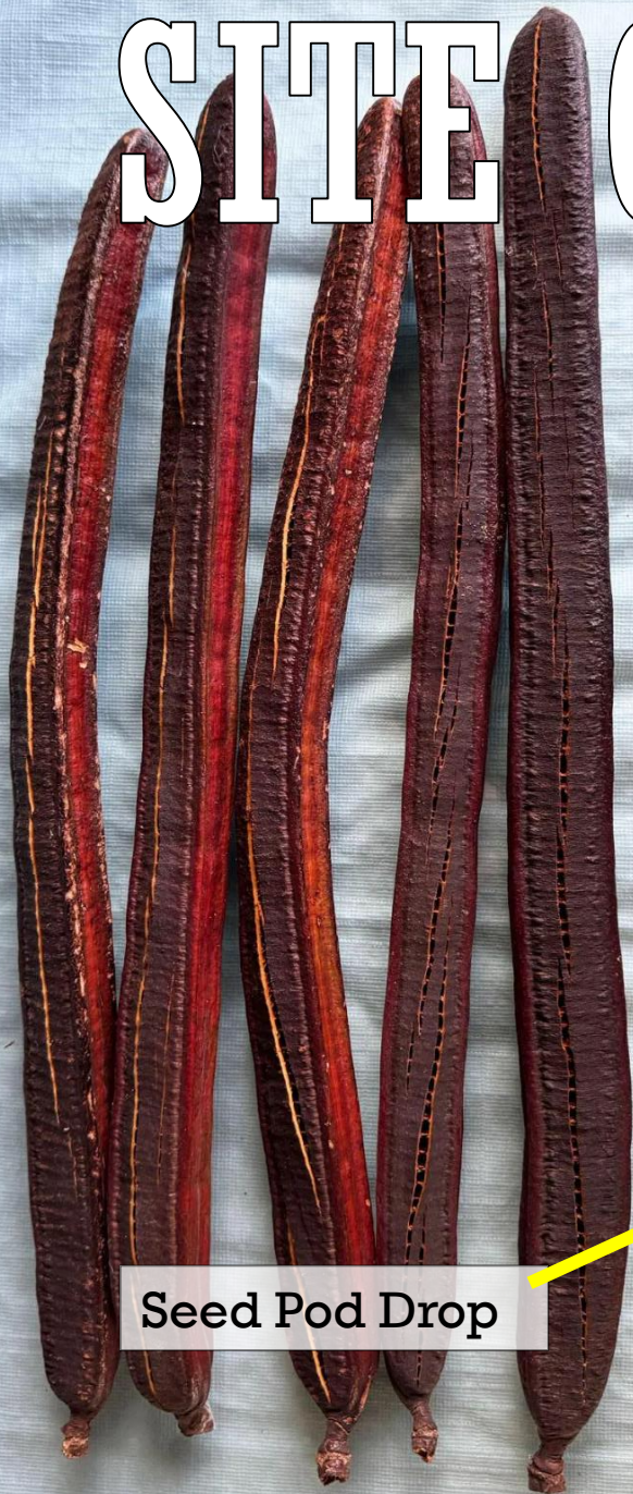
Seed Pod Drop