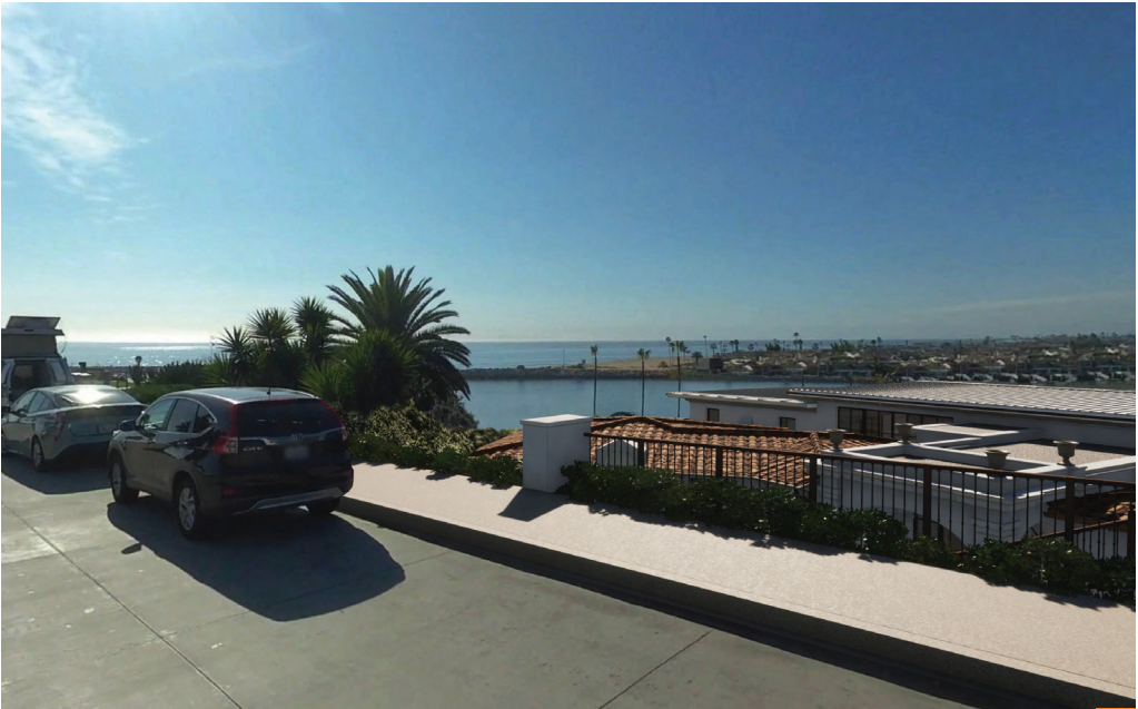
VIEW 3 FROM OCEAN BLVD - PROPOSED