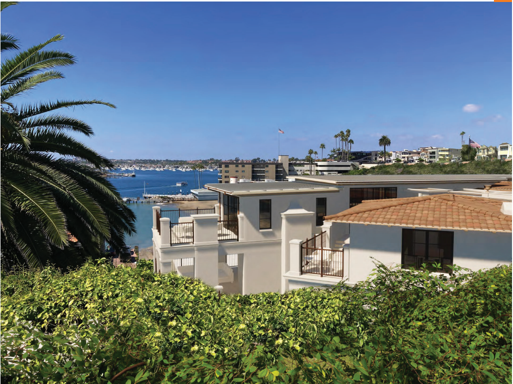
VIEW 4 FROM OCEAN BLVD - PROPOSED