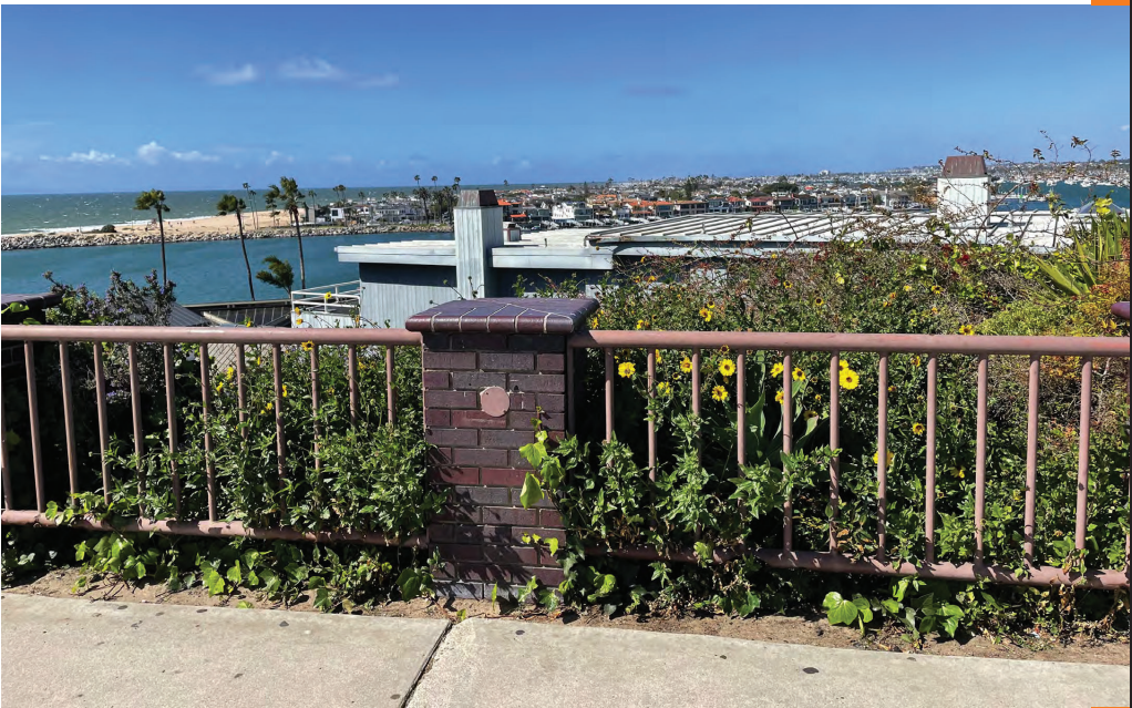
VIEW 2 FROM OCEAN BLVD - EXISTING