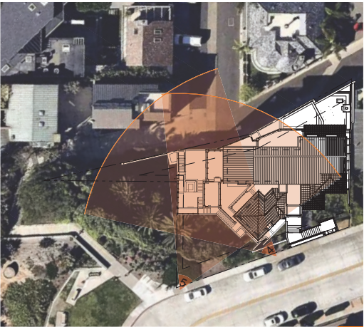
FULL SITE - KEY PLAN