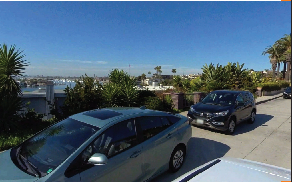
VIEW 1 FROM OCEAN BLVD - EXISTING