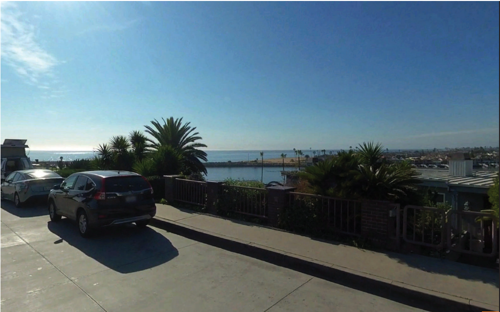
VIEW 3 FROM OCEAN BLVD - EXISTING