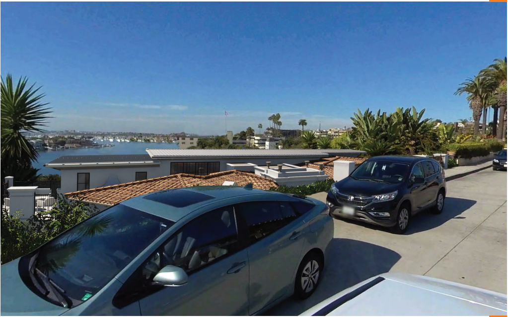
VIEW 1 FROM OCEAN BLVD - PROPOSED