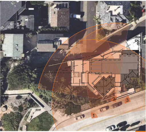
FULL SITE - KEY PLAN