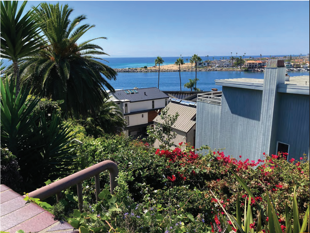
VIEW 5 FROM OCEAN BLVD - EXISTING