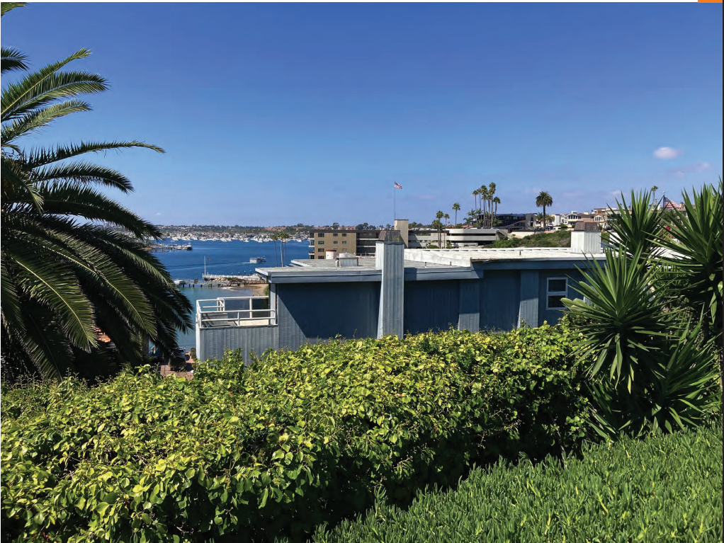
VIEW 4 FROM OCEAN BLVD - EXISTING