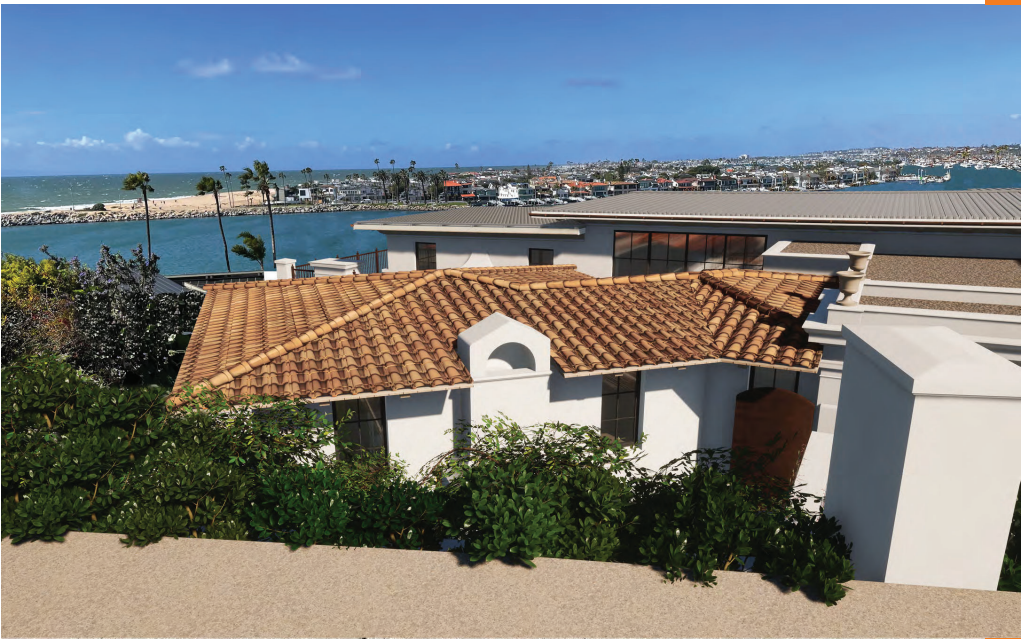
VIEW 2 FROM OCEAN BLVD - PROPOSED