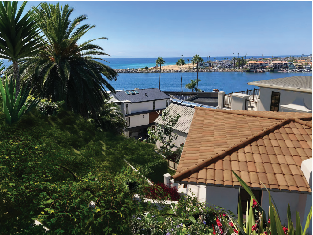
VIEW 5 FROM OCEAN BLVD - PROPOSED