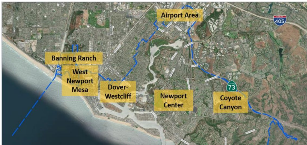
Figure 1, Housing Element focus areas for residential development

The adoption of these ordinances provided new housing opportunities within five subareas to ensure the City can meet its 6 th Cycle Regional Housing Needs Assessment (RHNA) allocation: Airport Area Environs Area (HO-1), West Newport Mesa Area (HO-2), Dover-Westcliff Area (HO-3), Newport Center Area (HO-4), and Coyote Canyon Area (HO-5). These subareas correspond directly to the Focus Areas identified in Appendix B (Adequate Sites Analysis) of the Housing Element and excerpted in Figure 1 below.