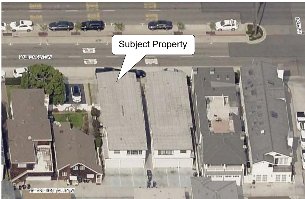
Figure 1: Oblique Aerial Image of Neighborhood