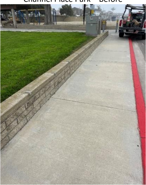
Channel Place Park - Before